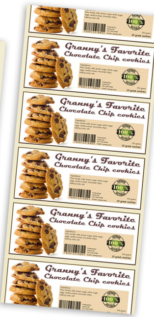
Private branded labels