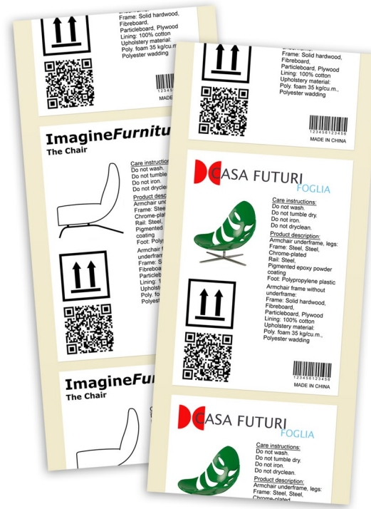
Be creative and move to colour