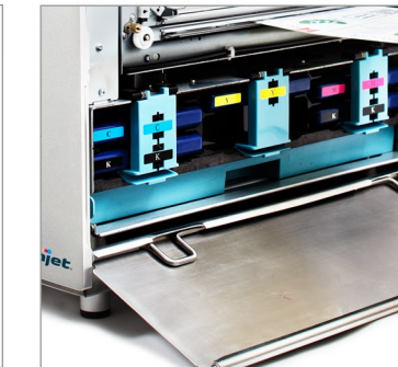
The Trojan LightWinders are the affordable choice for low volume printing