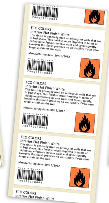
Hazardous material labels