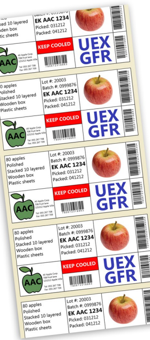
Illustrative logistics labels

Label printing has just been re-invented. Simply start with a blank label and be creative! TrojanOne is your solution to high speed on-demand colour labelling – affordable, high speed with no compromise on quality.